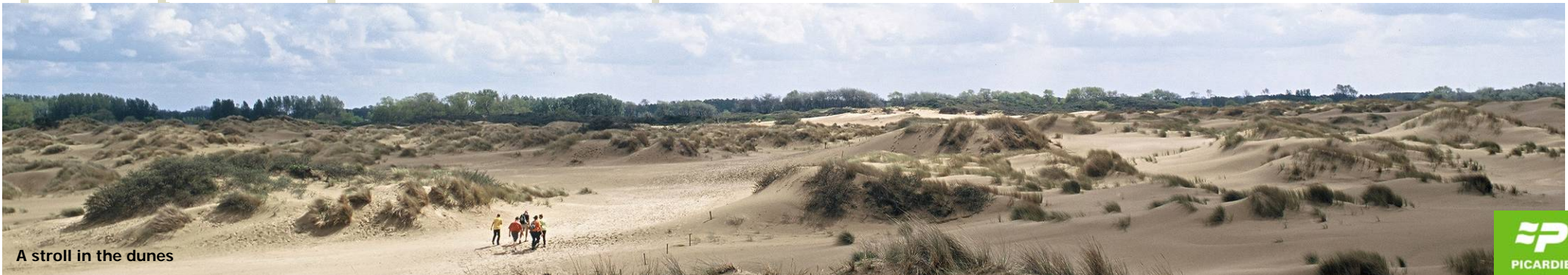
A stroll in the dunes